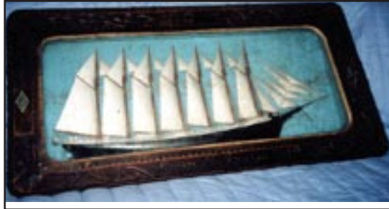
Visit the Museum to see a one-of-a-kind model boat, on display during Pepsi America's Sail! Call the Museum for details!

The "Carolina Workboat Review" is also being planned. The Carteret Fishermen's Association will be hosting the processional on Sunday, July 2nd at 1:30 p.m. The boat parade will begin at the N.C. State Port and proceed around Radio Island and Pivers Island to Taylor's Creek and the Beaufort Waterfront. This event is dedicated to the working fishermen of North Carolina and