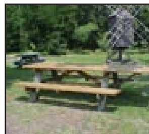
Local boy scouts of troop 252 built and donated the Museum's first wheelchair accessible picnic table for the Willow Pond site.