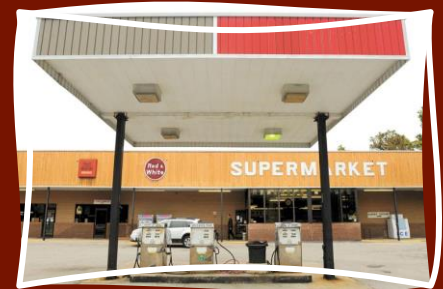
the Red and White