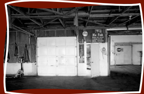
the fish house