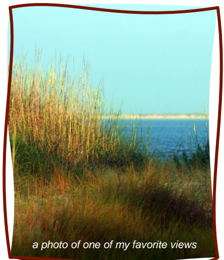
a photo of one of my favorite views

Protecting our sea oats is important for they are vital in the maintenance of healthy sand dunes. For this reason, it is illegal to interfere with them in any way. Instead, stand back and admire one of the many natural wonders our home provides.