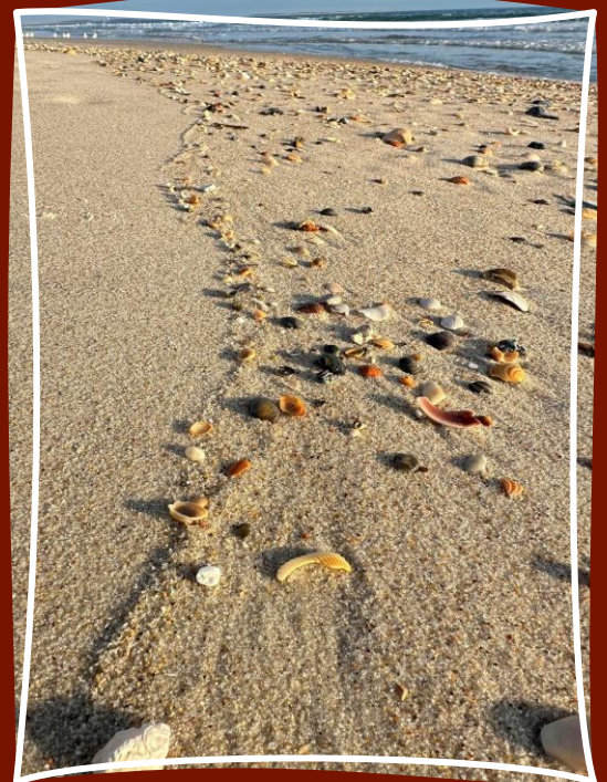
recent photo taken by Heidi Jo Hewitt Merkley

Additionally, the wrack line offers valuable insight into the health of marine environments, as changes in the composition of the wrack line can indicate shifts in ocean currents, pollution levels, and other environmental factors affecting coastal areas.