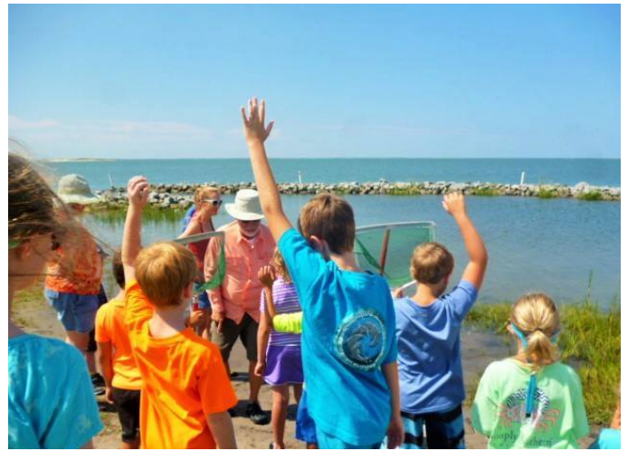
Children gather at Shell Point, Harkers Island to examine the marine life of Core Sound

Click here or search “Core Sound Soundside Learning” to follow us!