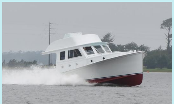
70' Lewis Yacht, The “Bobby-D” completes her sea trials circa 2014.