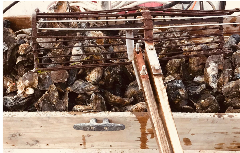
Oysters & oyster tongs rest on a culling tray after being harvested from Core Sound, circa 2019. See how local fishermen continue to use these traditional methods today at our education exhibits on Waterfowl Weekend!