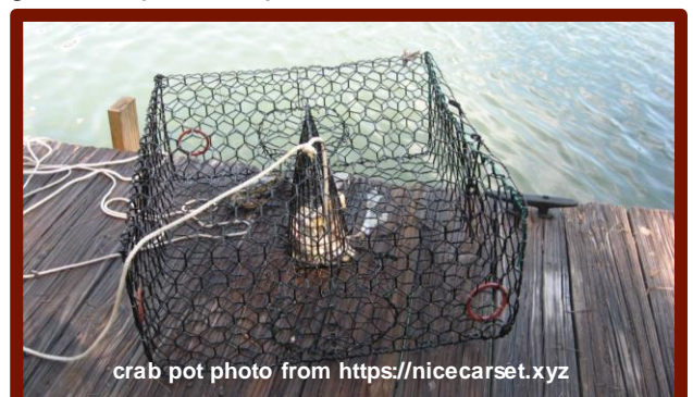
crab pot photo from https://nicecarset.xyz

To get crabs out of each pot, Dad pulled up and rested the pot on the side of his boat, unhooked a latch on one side of the top, turned it upside down and shook the crabs into a wooden fish box. He then refreshed the bait and reset the pot. Then he returned the next evening to do it all again.