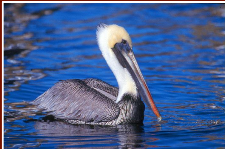
Eastern Brown Pelican

Most Brown Pelicans migrate south for the winter, but small numbers remain here year-round, though severe cold snaps may result in frostbite to their webbed feet and pouches. They can be found nesting in the Cape Fear River and in Pamlico and Bogue Sounds on small islands where they are relatively safe from disruptions and predation.