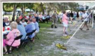
Plate Sponsors Available At All Levels

This summer event honors all those who serve our community including veterans and active military, first responders, powerline crews, teachers, law enforcement, and health care workers who we all depend on to keep us safe and healthy. The 2nd MAW Band from Cherry Point MCAS is always the high point of this celebration!